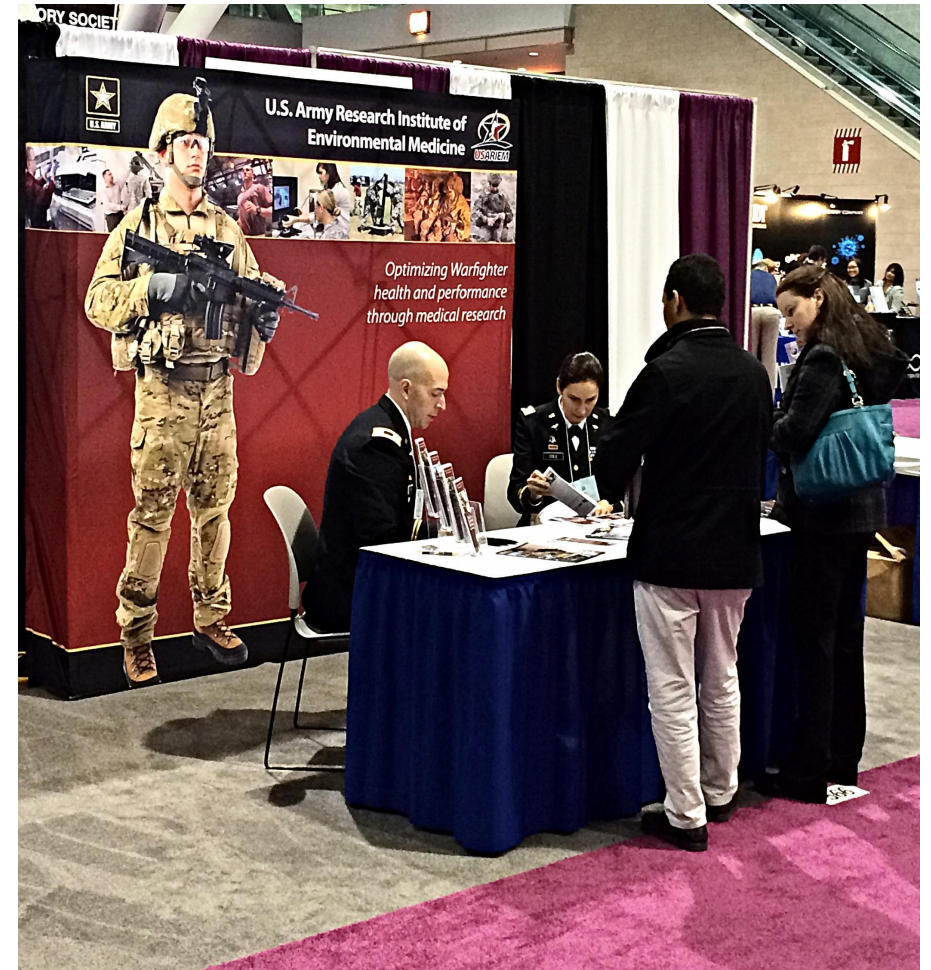
ASBMB 2015 Annual Meeting, Boston 2015

BUT many scientists work for other military and security federal agencies, defense contractors, or have military funding in academic laboratories.